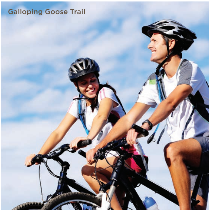
Galloping Goose Trail