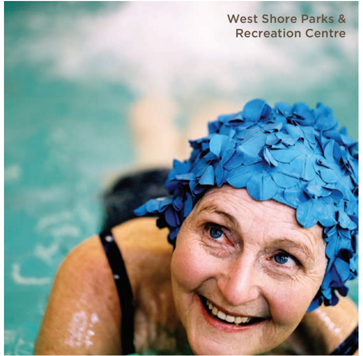
West Shore Parks & Recreation Centre